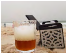
A cup of tea

B. Make the right invitation for each of the following pictures: