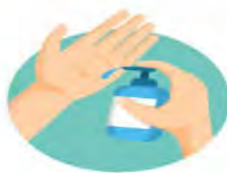
use hand sanitizer