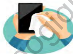
Disinfect personal belongings