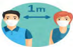
keep a distance