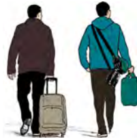
People on a trip